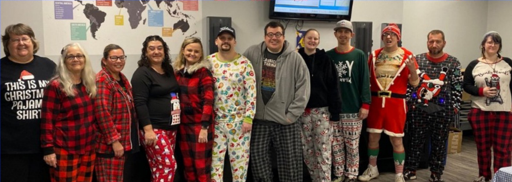
Dec. 16 Advantage gets in the Christmas spirit on Christmas PJ Day 2021.